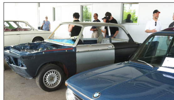
The "Bimmer in the Barn"