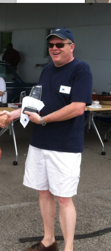
Prince, 1967 2000CS