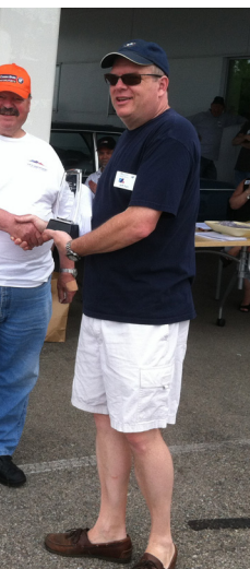
wald, 1971 2002