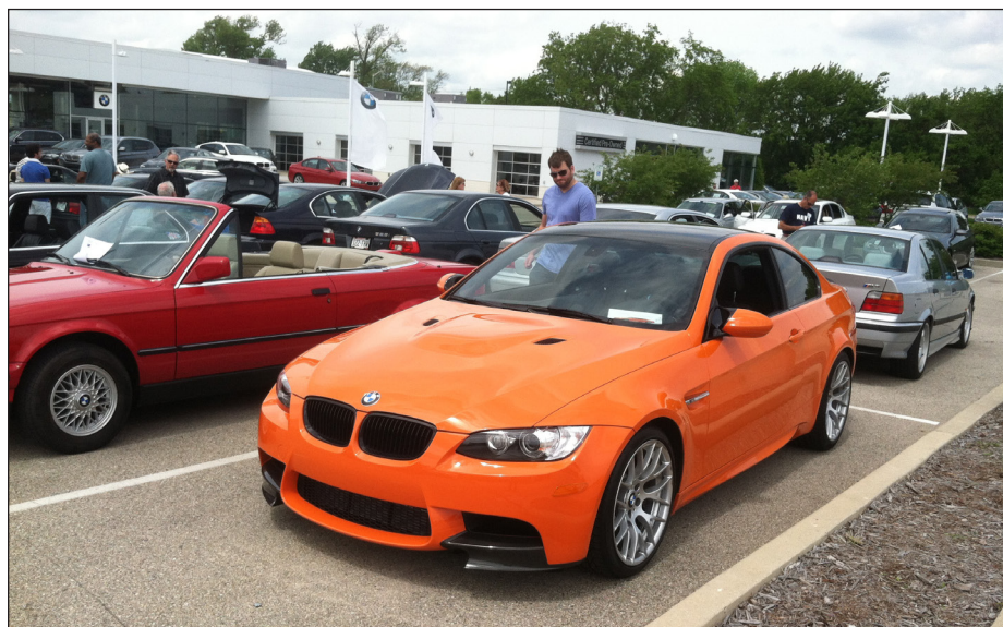
Limerock Edition M3